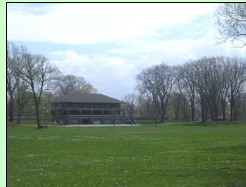
Figure 52 - The filled in lagoon inhibits the Casino's historic function as a boat house