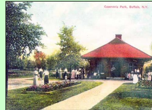
Figure 54 – Historic postcard of the Shelter House