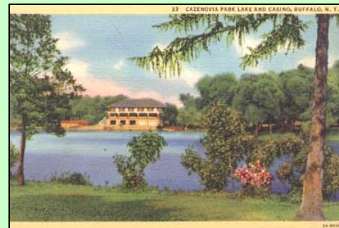
Figure 51 - Historic postcard of the lagoon in front of the Casino

The Charette process revealed the following grouping of the projects currently under consideration by the BOPC and