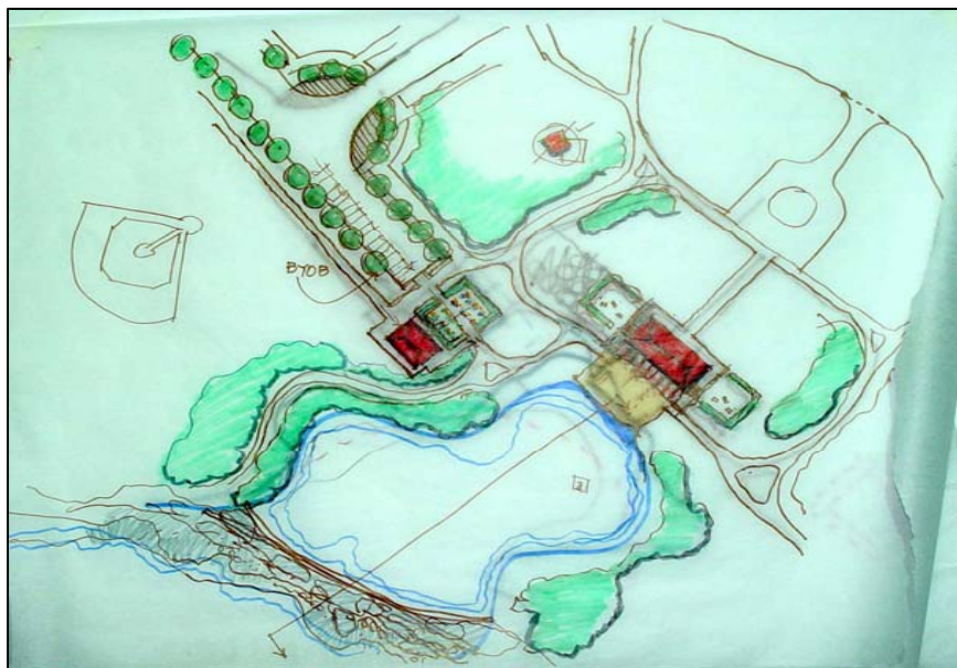
Figure 57 - Concept design for the Casino Area and lagoon