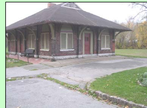
Figure 55 - Recent photo of the Shelter House